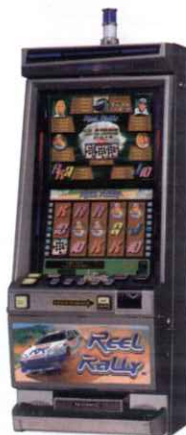
AGI's Reel Rally

Looking for more up-to-date news from the gaming marketplace? Visit the Gaming Headlines newsfeed at www.ascendgaming.com .